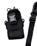
NCN011 Nylon Carrying Jacket