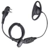
EHM15-A D-Style Earloop

External earpieces with in-line PTT Mics and VOX (hands free) switch