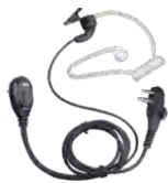
EAM12 Transparent Acoustic Tube Earpiece