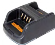
CH10A06-PS2002 Dual Pocket Charger (Radio and one battery) with Power Adaptor