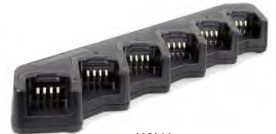
MCA08 Multi-unit Charger for Six Li-ion Batteries with power supply (12V/7A)