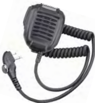
SM08M3 ① IP54 Rated 3.5mm audio jack

Remote Speaker Mics provide easy access for audio, are IP rated for water resistance, and have audio jacks for receive only earpieces.