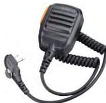
SM26M1 ② IP54 Rated 2.5mm audio jack