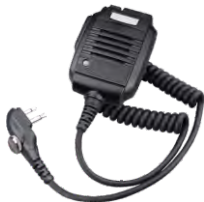
SM13M1 ① Noise Cancelling with High / Low Speaker Volume IP55 Rated, 3.5mm audio jack