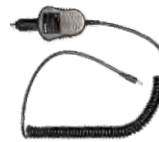
CHV09 Vehicle Adapter (Input: 11-25V DC, Output: 12V DC & 1A)