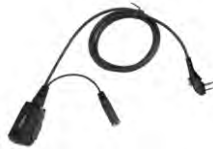
ACM-01 PTT and Mic with 3.5mm Jack Connects to a variety of Receive-only Earpieces ①